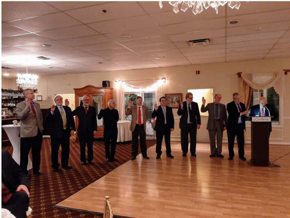
Installation of New Officers & Directors